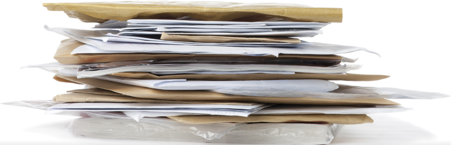
Abb.: © istockphoto, Oktay Ortakcioglu

The LVM Group truly understands how positively centralized document mailing affects the company's entire infrastructure. As one of the 20 largest primary insurers, LVM separated document creation from distribution and since then has been enjoying both significantly higher performance in output management and less programming effort. The core technology is Compart DocBridge Pilot software, which acts as the central hub in the enterprise's communications.